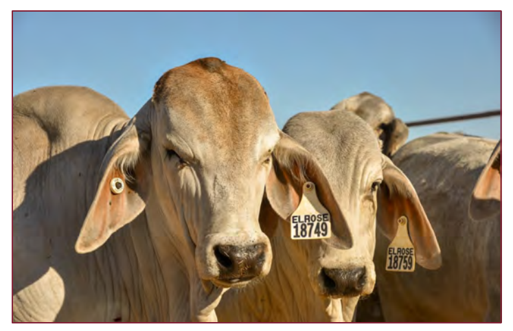
Cattle at "Elrose" Brahman Stud, Cloncurry

As such, the non-corporate Commonwealth entity reporting requirements as per section 17AD(d) – Management Accountability and 17AD(f) Other Mandatory information of the Public Governance, Performance and Accountability Rule 2014 are encompassed within the operations and reporting of the Department of the Prime Minister and Cabinet.