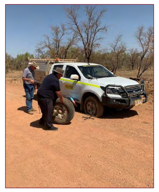
Another day on the road, NW Queensland